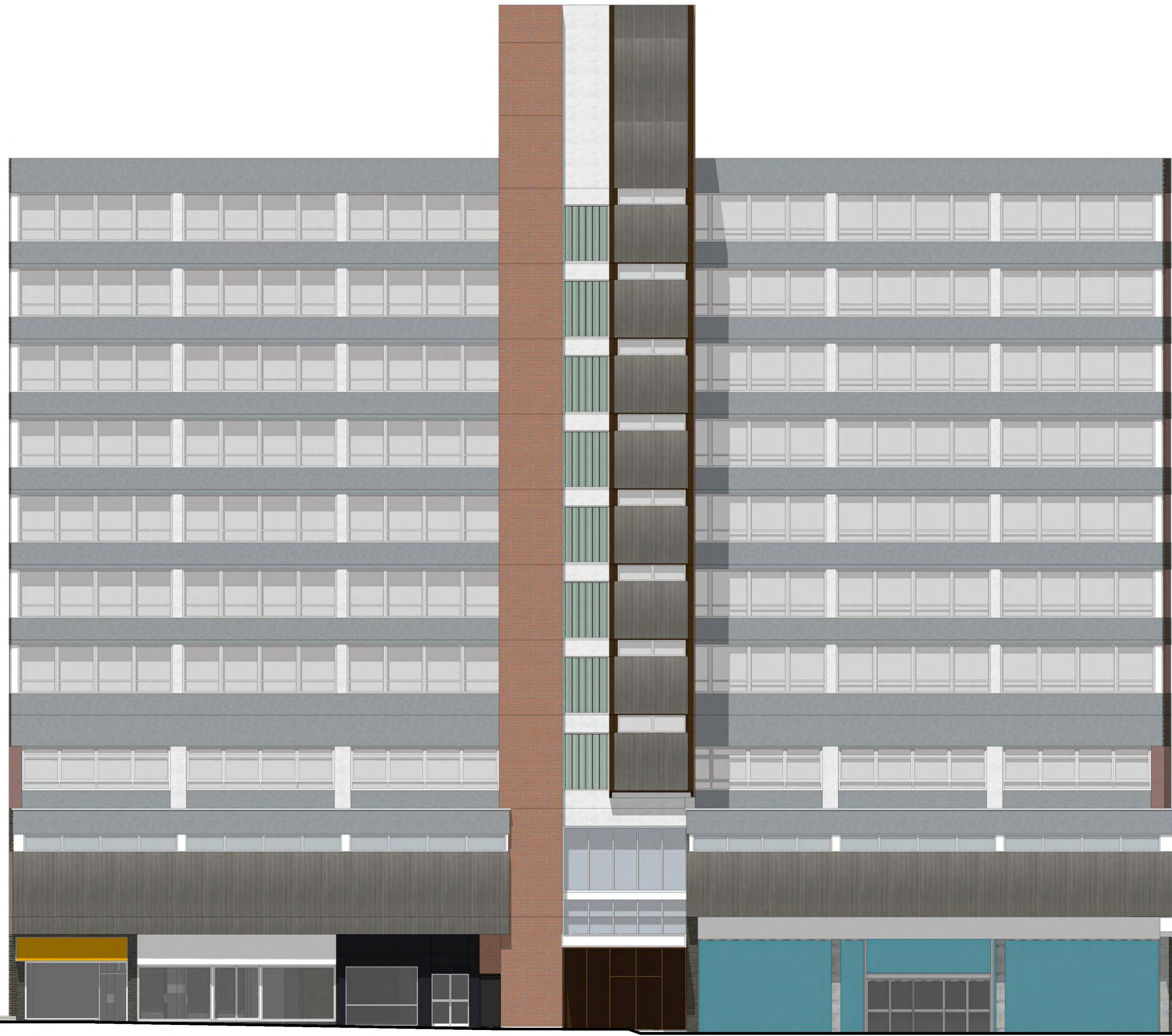
EXISTING FRONT ELEVATION SCALE 1:100 @ A1