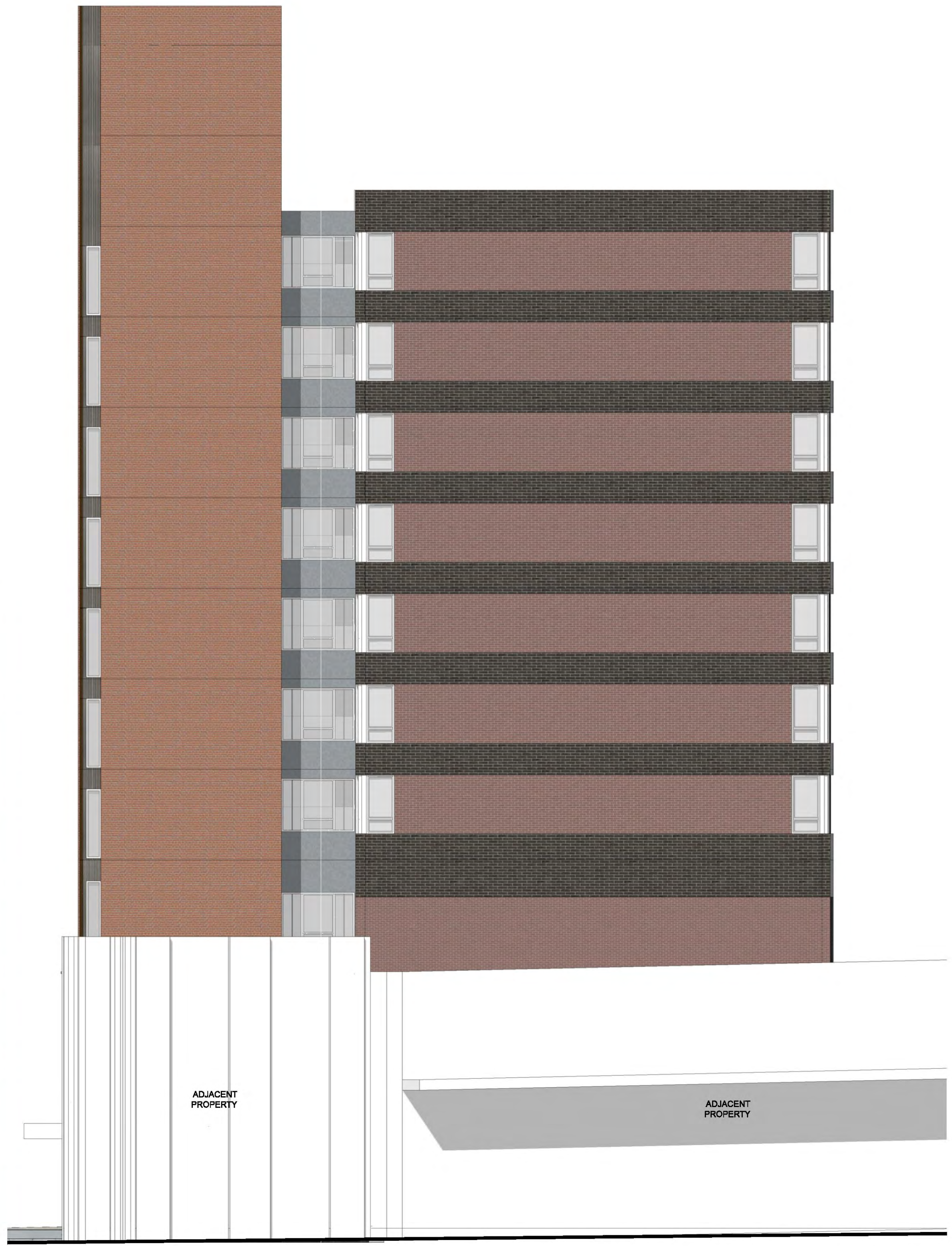
EXISTING SIDE (RIGHT) ELEVATION SCALE 1:100 @ A1